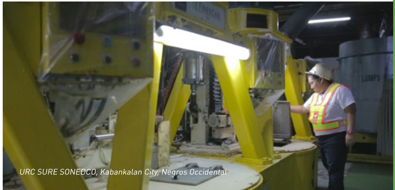
URC SURE SONEDCO, Kabankalan City, Negros Occidental

We have identified waste management as a strategic priority, and we intend to further improve on our existing programs.